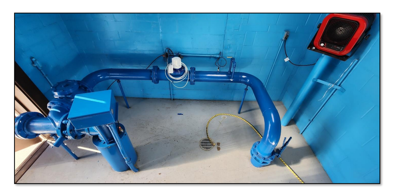
Typical well interior