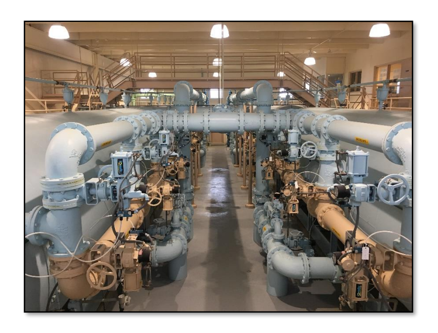
Water Treatment Facility - Interior