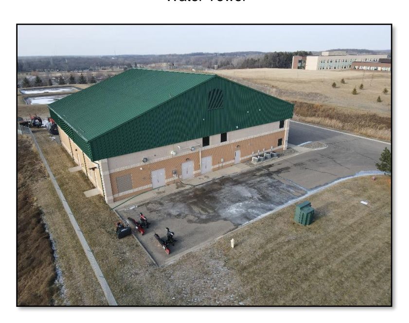
Water Treatment Facility